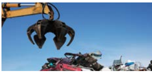
Waste & recycling control