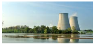
Nuclear access control