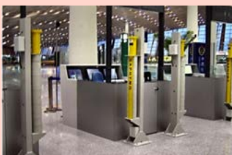
Radiological control for pedestrian