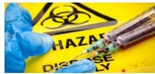
Hospital waste control