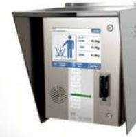
Self Service Driver Terminals