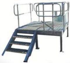
Walkways & Platforms